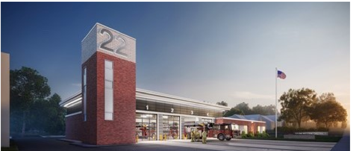
INITIAL RENDERING OF THE NEW STATION LOCATED AT 424 SOUTH MAIN STREET IN THE BOROUGH

*Final design, lighting, and exterior coloring may change